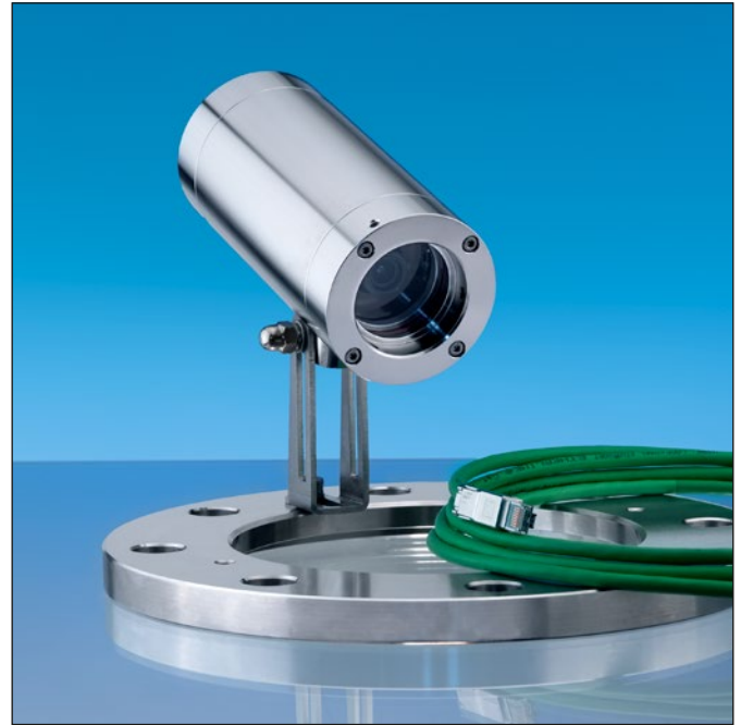
VISULEX camera K55-HD-Ex mounted on a flange with a hinged bracket