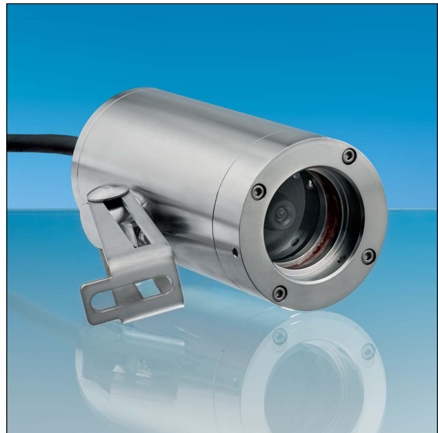
VISULEX camera K55-P with fixed lens

Any replacement of the camera assembly should be carried out by the manufacturer and/or done at the manufacturer's works (F.H. Papenmeier GmbH & Co. KG).