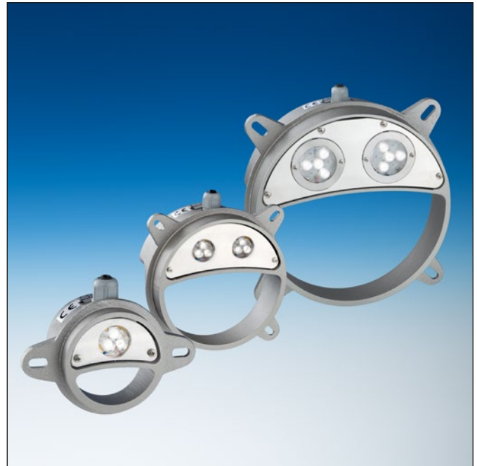
Lumiglas luminaires Lumistar-LED