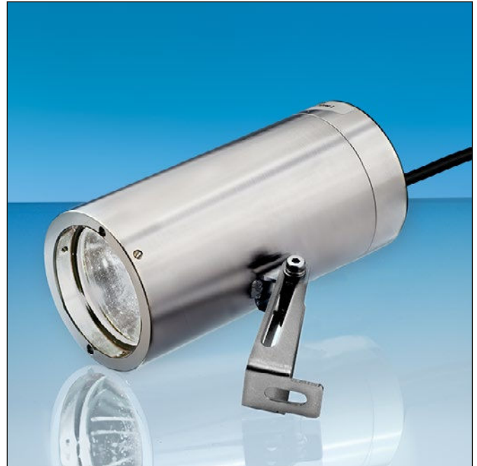
Lumistar luminaire USL 16-LED with hinged bracket