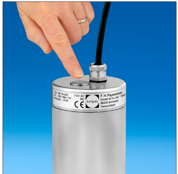
Lumistar luminaire USL 16-LED with push-button operation

• Mounting parts for USL 16-LED: The luminaire mounting (hinged bracket) is included in the scope of supply. The flange collar for mounting on screw-type sight glass fittings of DN 65 and greater should be ordered separately.