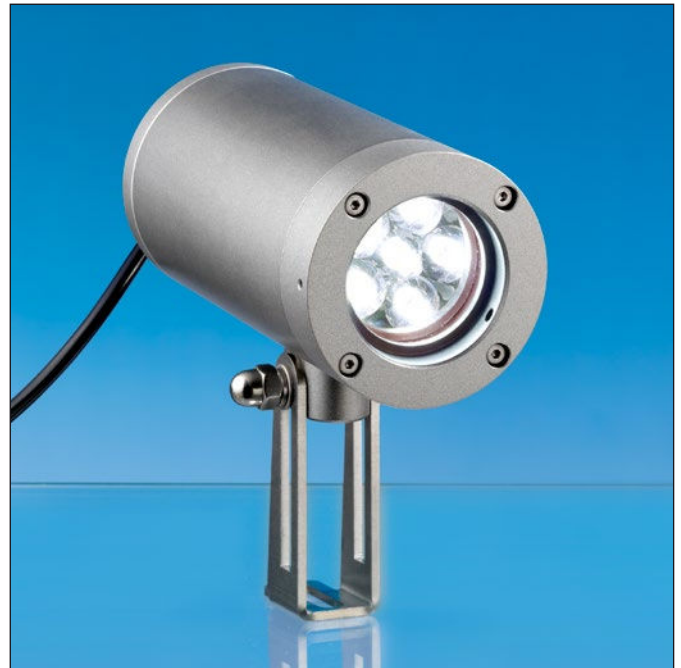
Lumistar luminaire ASL55LED-Ex