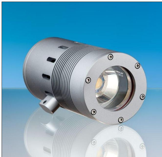
Lumistar luminaire ASL57LED-Ex