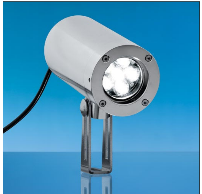
Lumistar luminaire ESL55LED-Ex